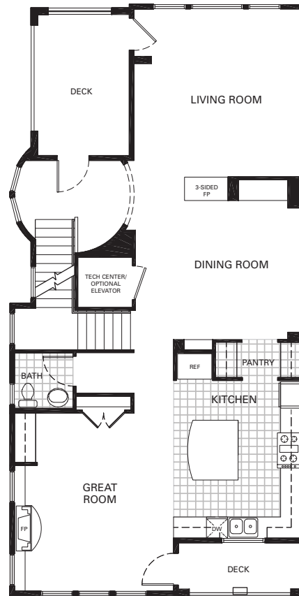
SECOND FLOOR – 1,261 SQ. FT.